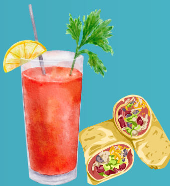
Bloody Marys & Tacos